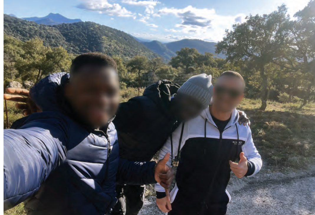
Faces blurred for security

We invite you to celebrate the incredible work the Lord has accomplished through your support. Your continued partnership in 2025 will empower AFCI's 23 nations in advancing God's Kingdom worldwide.